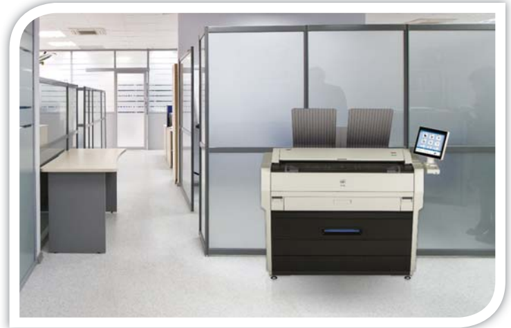
Space Saving Design