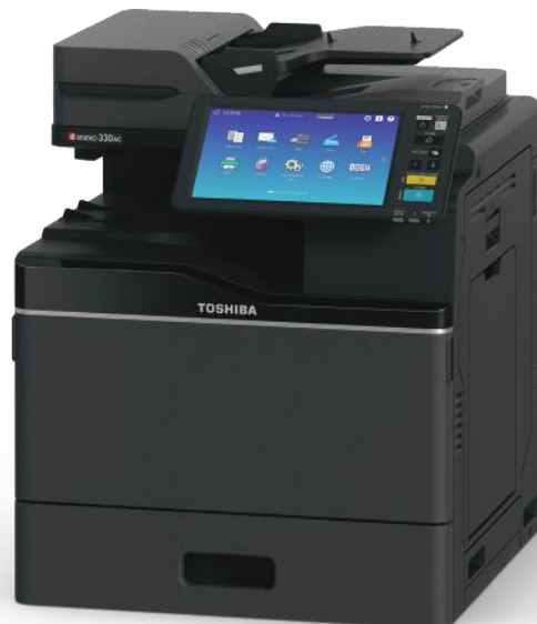
The e-STUDIO330AC/400AC Series is small enough for the desktop but big enough for the most demanding jobs with impressive features you'd expect to find on Toshiba's larger departmental MFPs.

This series not only has a compact footprint, but a compact carbon footprint. They are RoHS compliant, use recycled plastics, and have a Super Sleep (1W) Mode. They also reduce the environmental impact by being EPEAT Gold and Energy Star V 3.0 certified.